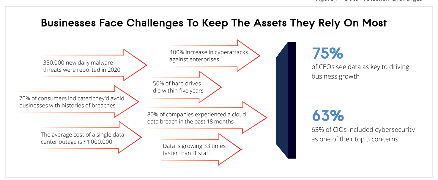
Figure 1—Data Protection Challenges 6-10

Let's look at the core backup and recovery features built into Acronis cyber protection products, then dive into their advanced security capabilities.